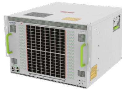
7700R4-128PE: 128 port 800GbE Distributed Spine Switch